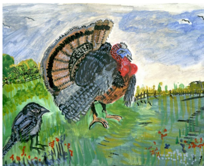
One of the 2016 Christmas cards